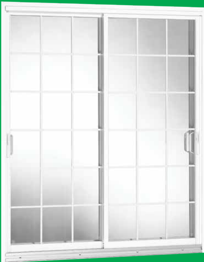
Door with white rectangular standard grills

NOBODY builds leading-edge patio doors like Standard Doors Inc. has for over 50 years.