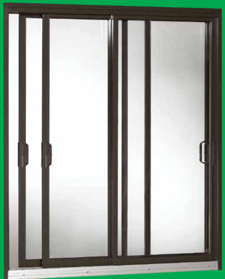
Commercial Brown Door