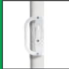
"D" shaped interior handle